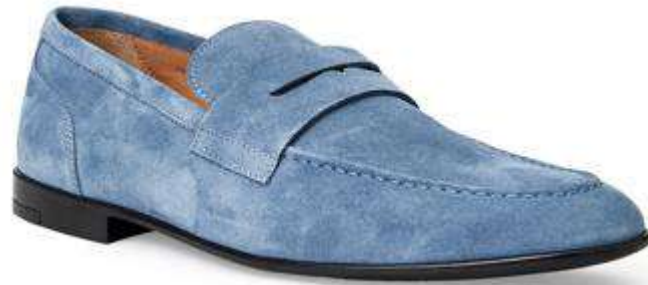
Lt Blue Suede