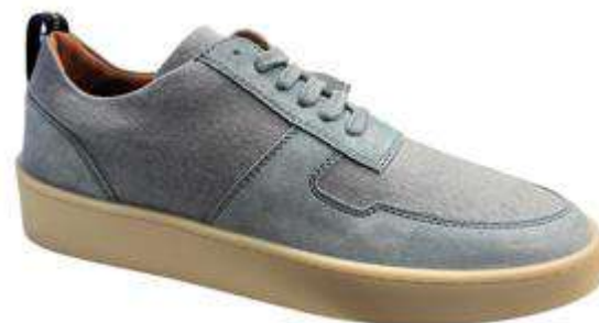
Lt Blue suede