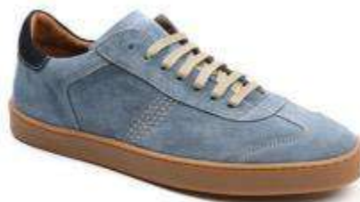
Light Blue Suede