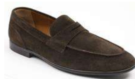
Dk Brown Suede