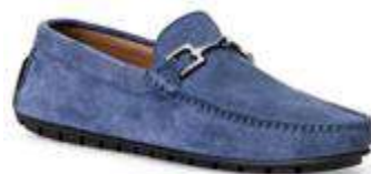
Lt Blue Suede