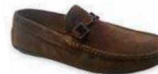
Dk Brown Suede