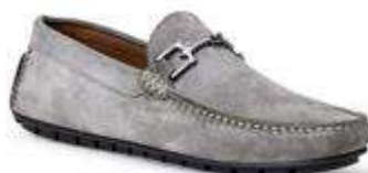
Lt Grey Suede