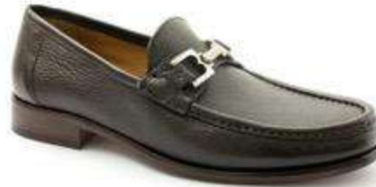
Dk Brown Cervo